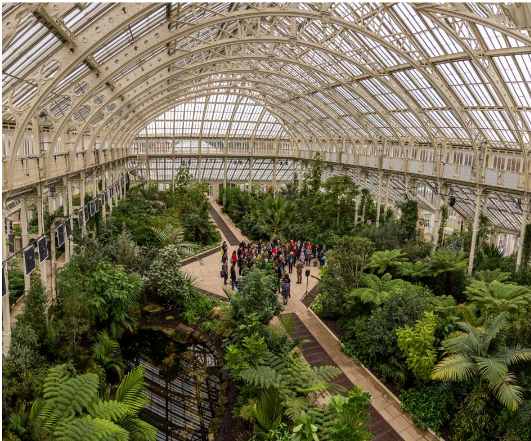
Photo: Bgen Conference 2019 at Royal Botanic Gardens Kew

Botanic Gardens Education Network c/o Museum No.1 Royal Botanic Gardens Kew Richmond TW9 3AB